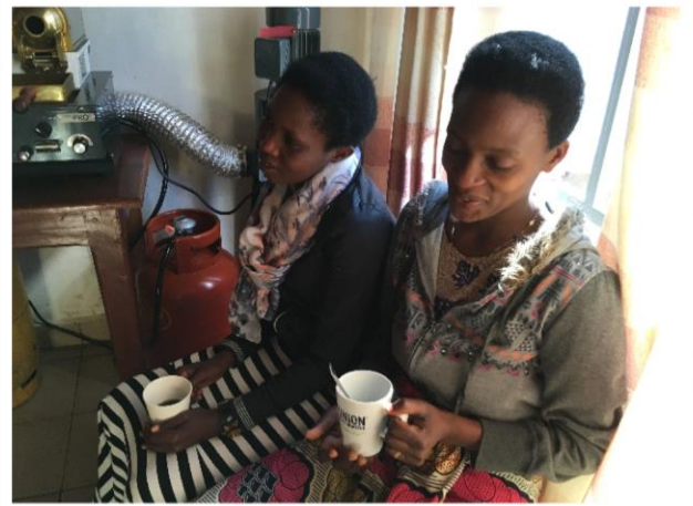
R: COCAGI cuppers enjoying their java!