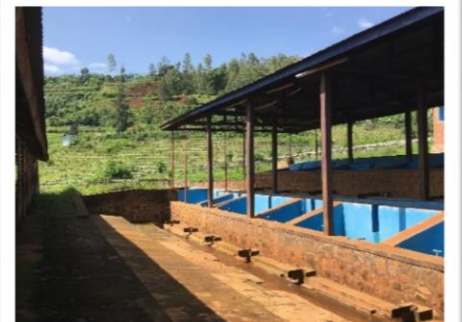
L to R: COCAGI headquarters along the main road in Rusizi. Agasaro women receive their premium. Fermentation tanks at Butambamo washing station.

Artisan Coffee Imports, LLC, 1550 Westfield, Ann Arbor, MI 48103