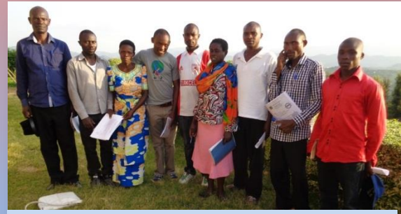
Team leaders trained in Lean in Rwanda

Profitable, Climate Smart and Gender Equal Coffee Processing